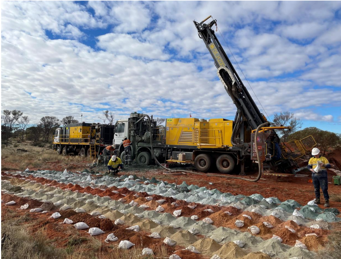
Figure 2 - Orlando RC Drill Rig operating at Abercromby Gold Project

The Company has engaged Orlando Drilling to undertake the drilling, with an RC currently operating on site.